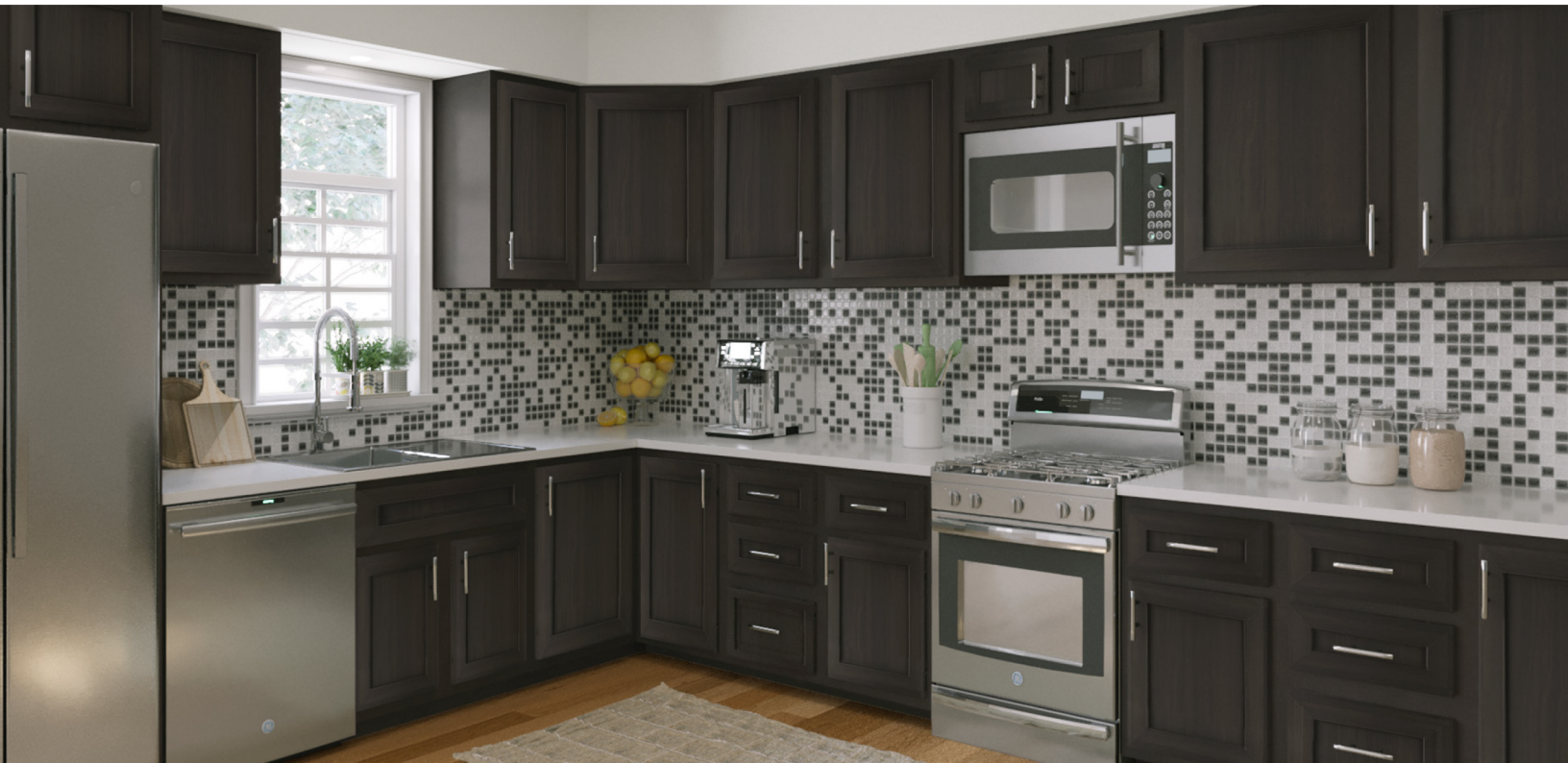
Shaker Classic Espresso

Edge Supply provides quick delivery and huge savings compared to full cabinet replacement. Our kit and video instructions are all you need to easily rejuvenate your kitchen and bath.