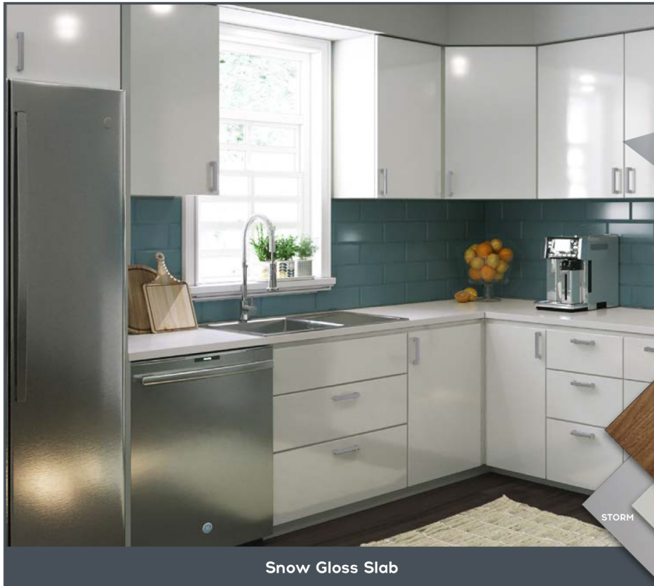
Snow Gloss Slab

SLAB: A clean, modern look available in 9 colors and a primed-for-paint option.