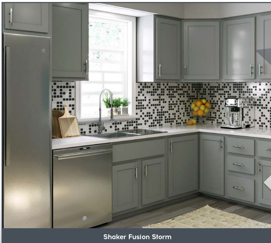
Shaker Fusion Storm

FUSION: Slab drawer fronts in combination with 5-piece door fronts.