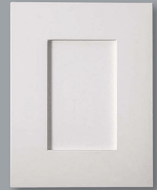
Paint Ready Shaker Classic